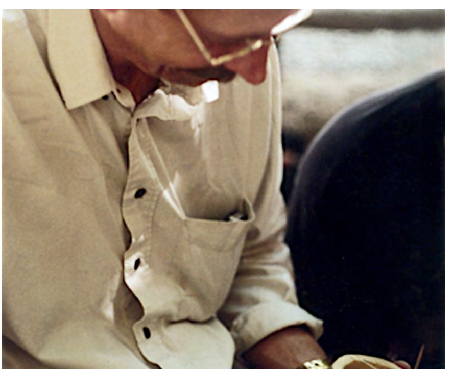
What bunraku is?

For centuries, Japan has taken everything came from outside. At that stage some historical puppeteers developed a unique technique. Until then, a man could move by himself, as usual, one or two puppets; in these new schools puppets began super expressive trying to trace the movements of human being.